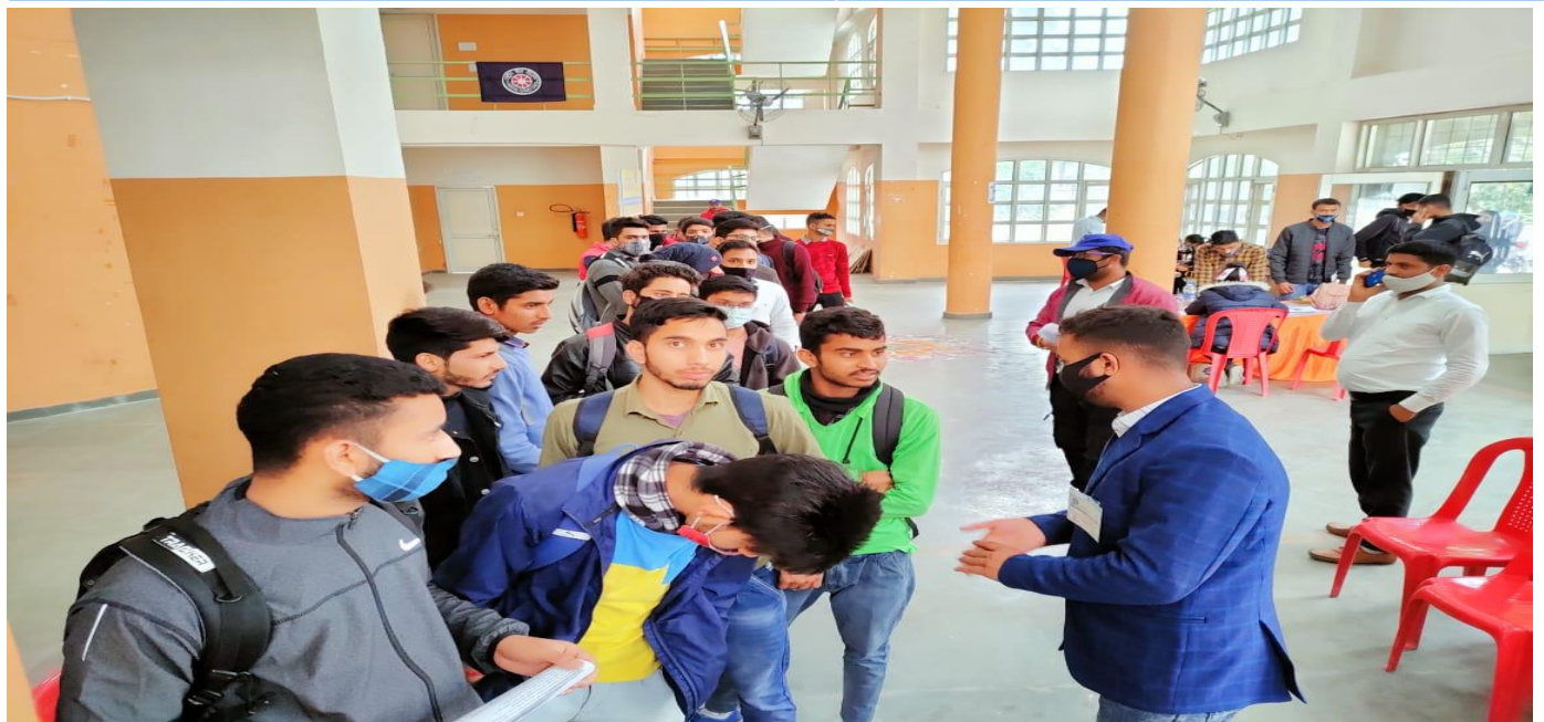
Volunteers during essential services and doctor assistance and Blood transportation