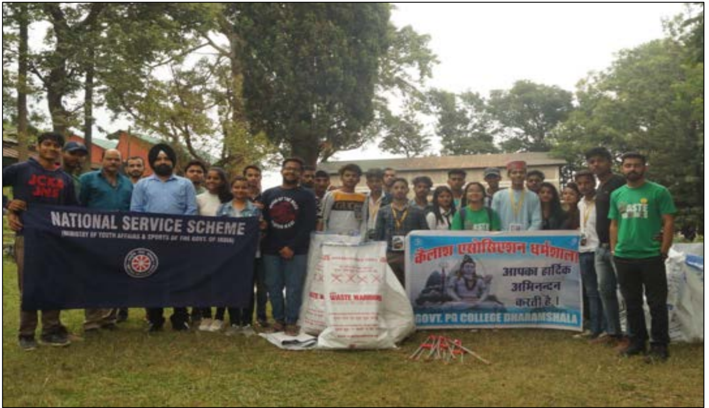
Volunteers with Waste warriors cleaning College canteen area