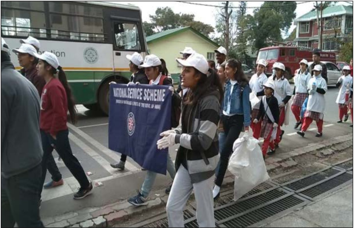
During Cleaning Drive and rally