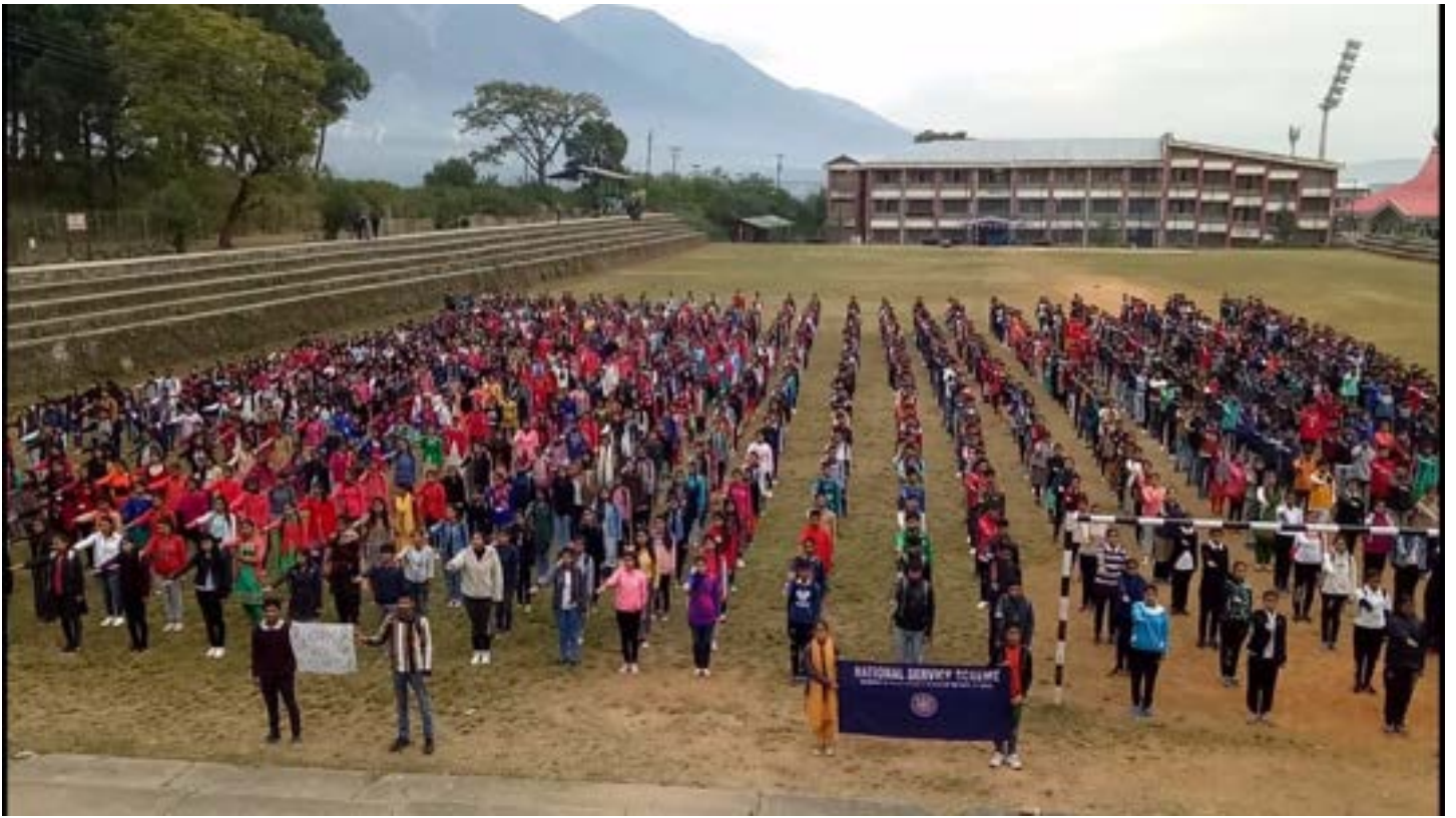
Oath Taking Ceremony on Drug abuse