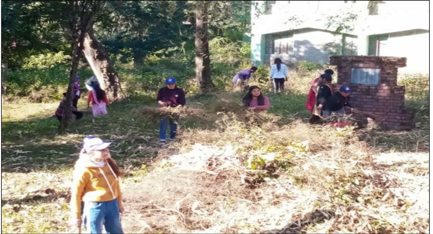
Volunteers during Cleaning drive at College campus