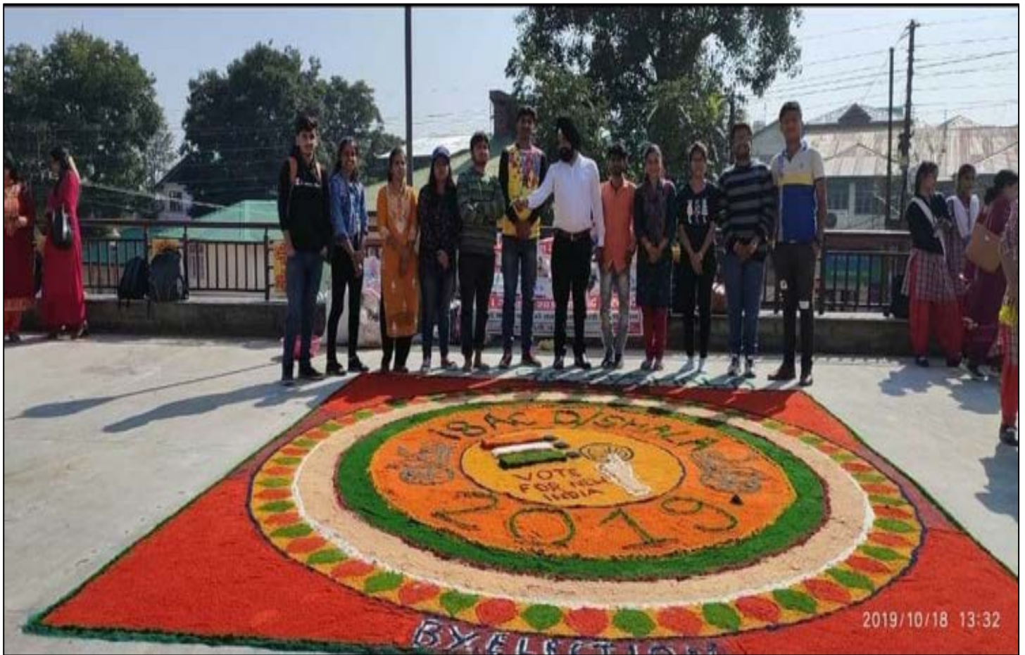
Mega level Rangoli Making with Election Commission