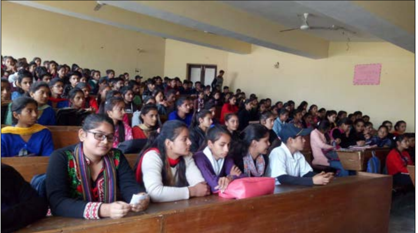
During Literacy day celebration and with gender sensitization talk