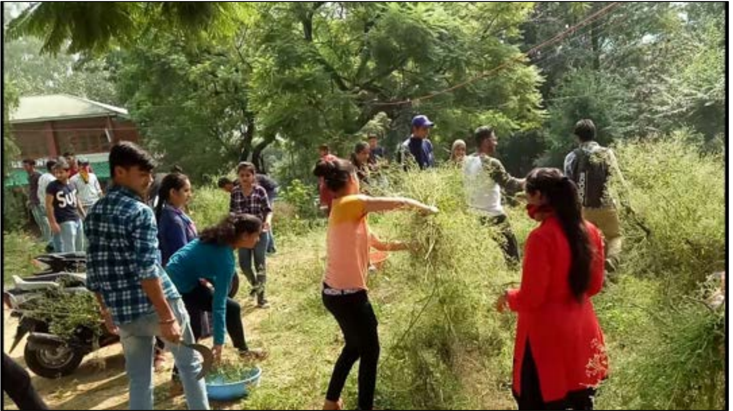
Volunteers during Cleaning Drive at College Campus