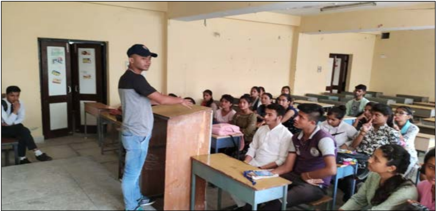
During Body meetings and motivating Volunteers