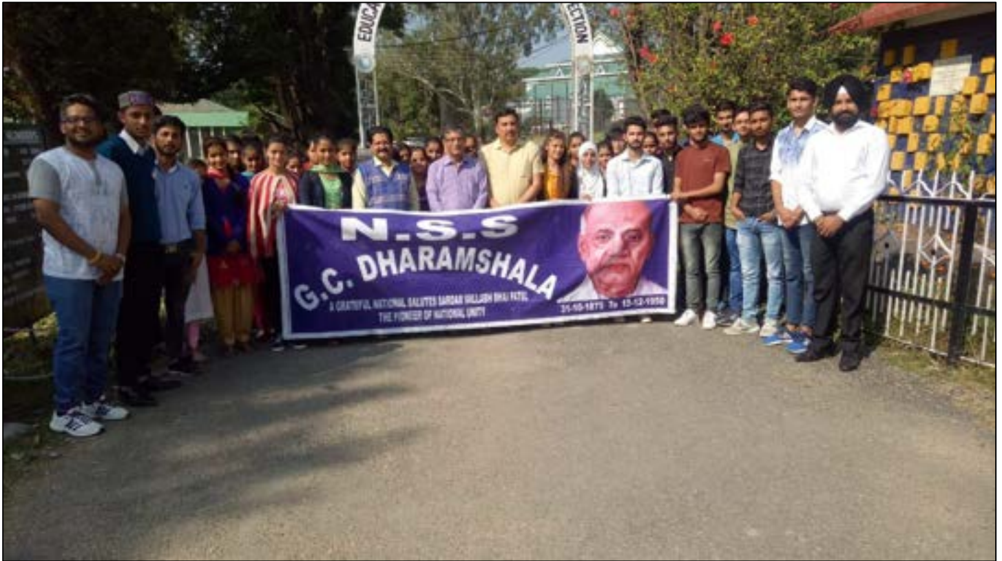
NSS Volunteers with College Students starting rally