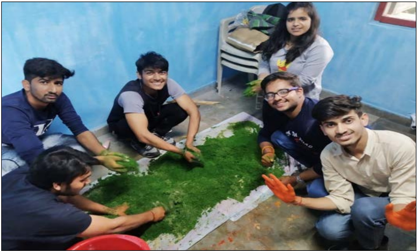
(26) Cleaning Drive with MCD