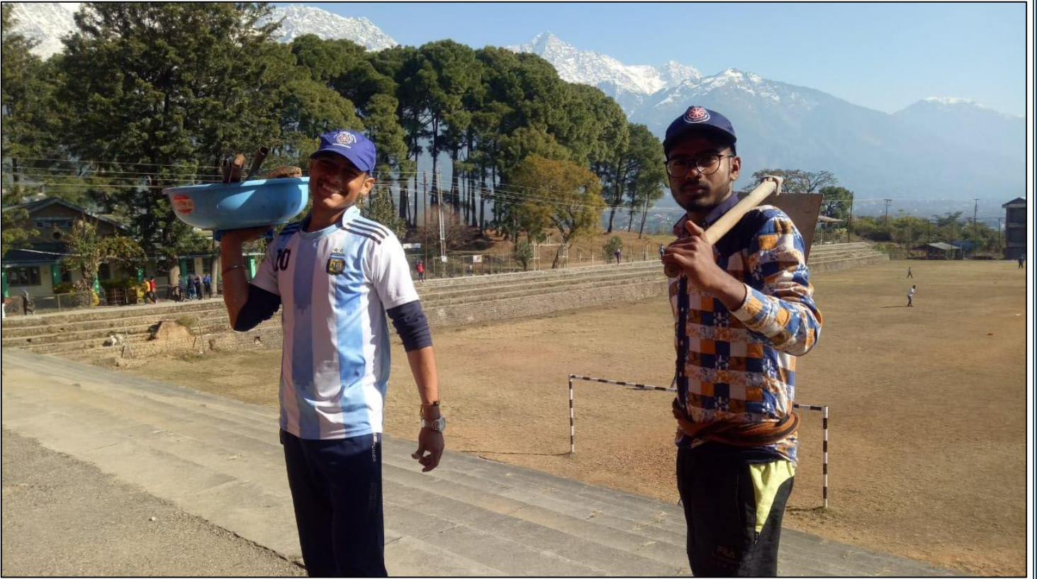
volunteers cleaning college ground area and stairs