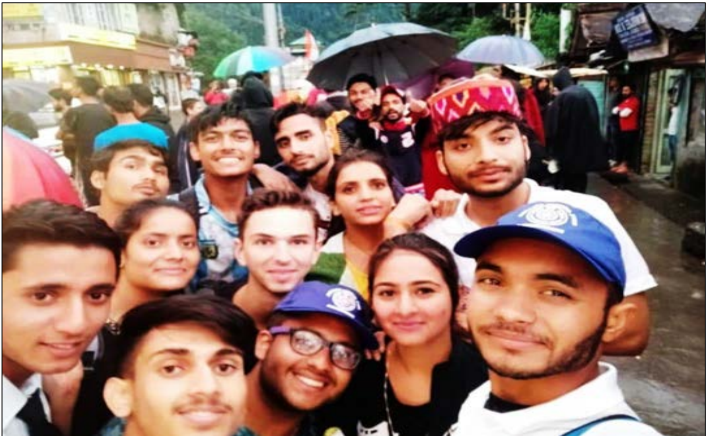
Group photos with banners and slogans on climate change