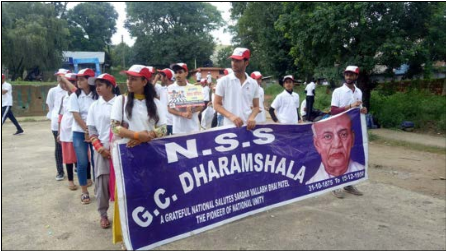
During Mega level Rally on Road safety as a culture