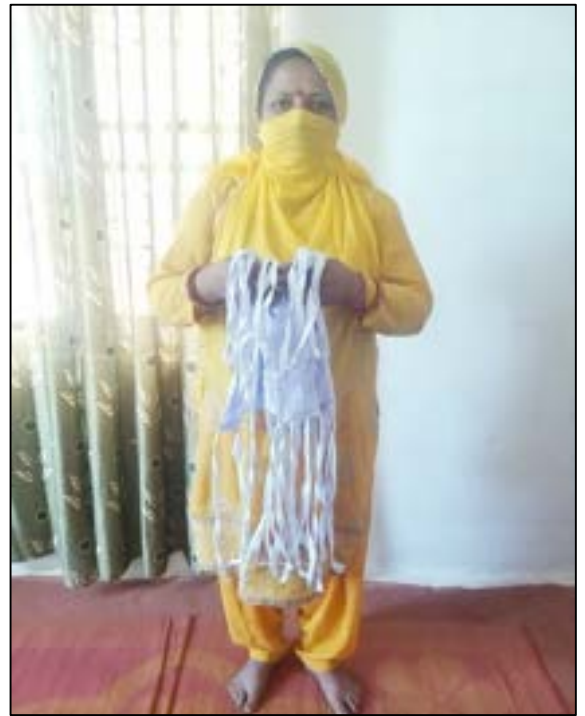
Mega Mask making Drive by the volunteers and Parents