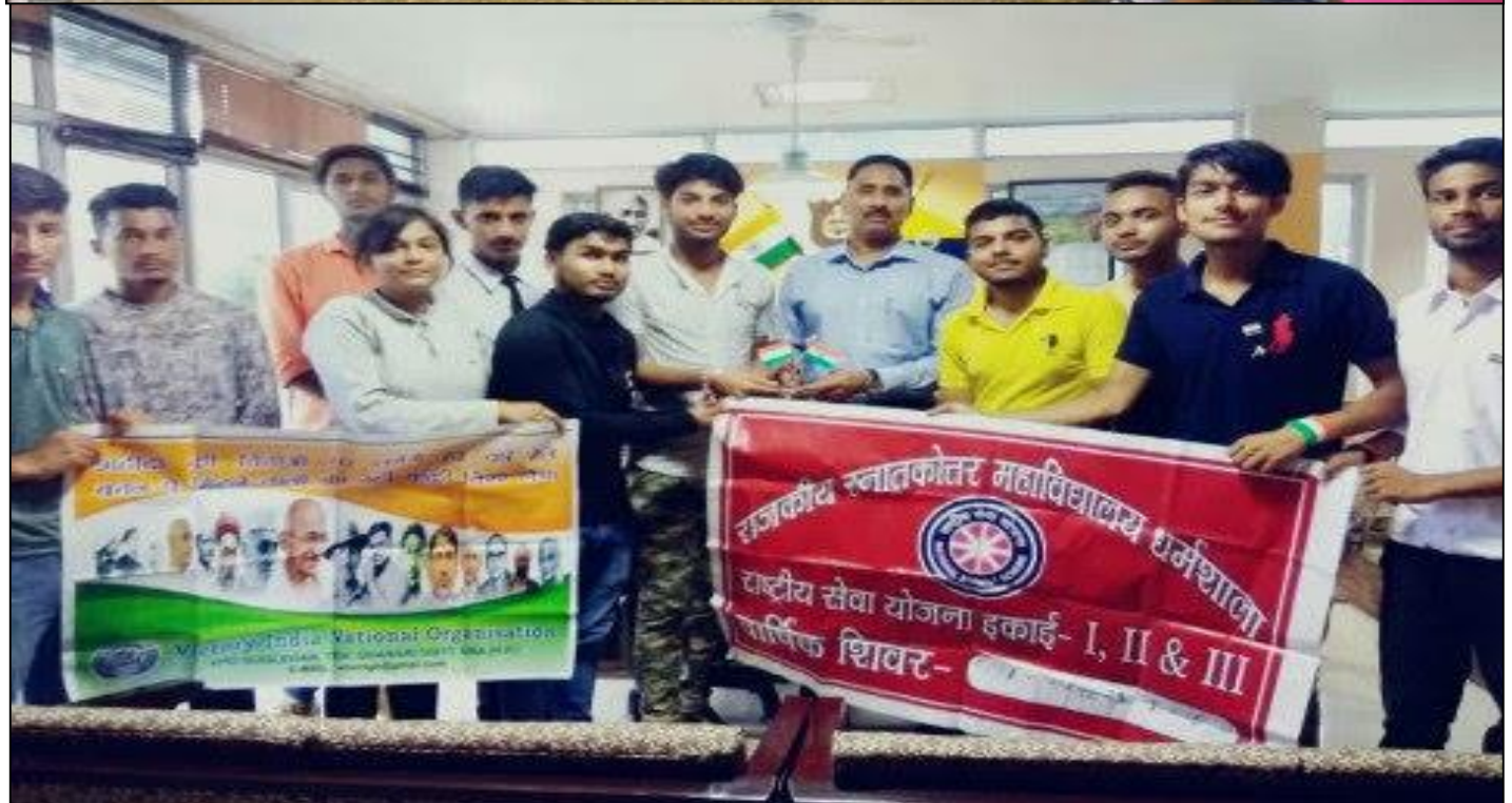
Volunteers with SP Kangra at Dharamshala