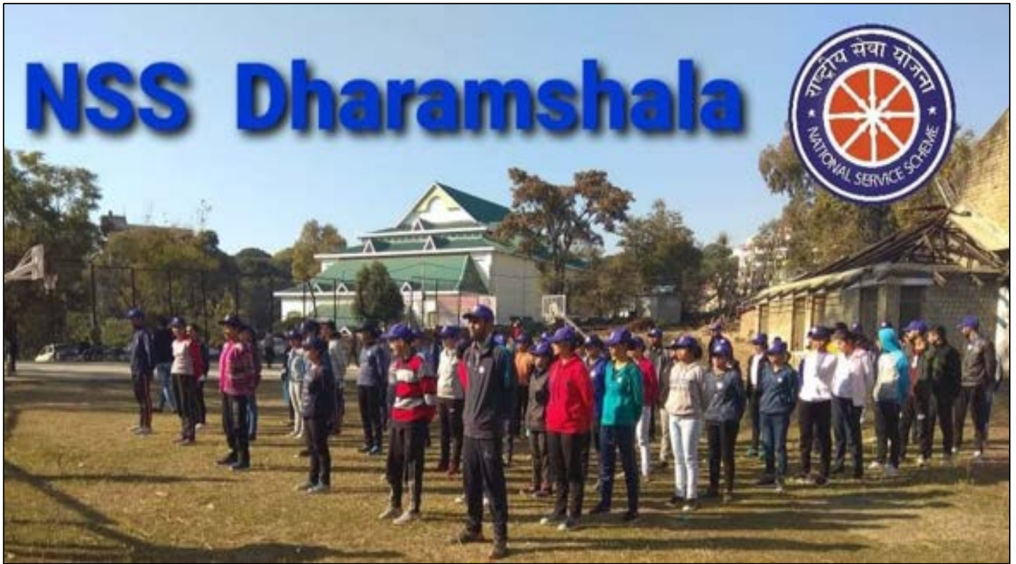
Ground and Drill practice in college campus