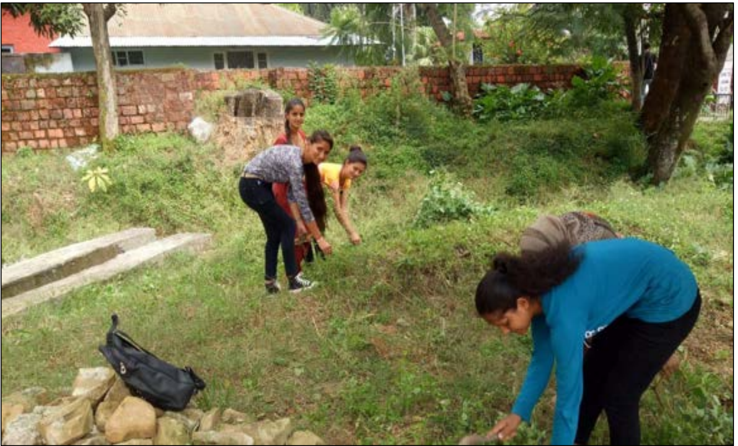
During Cleaning Drive under Swatch Bharat Abhiyan