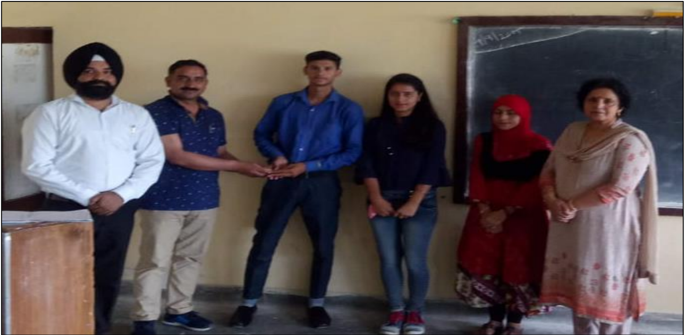
NSS Volunteers celebrating Teacher's Day