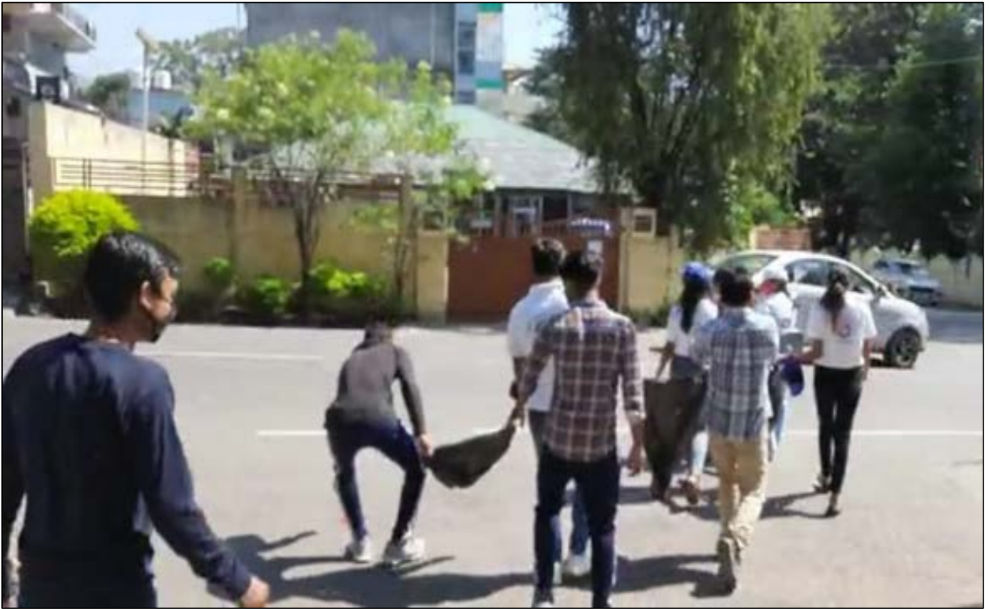
Cleaning drive at College Campus and stadium road