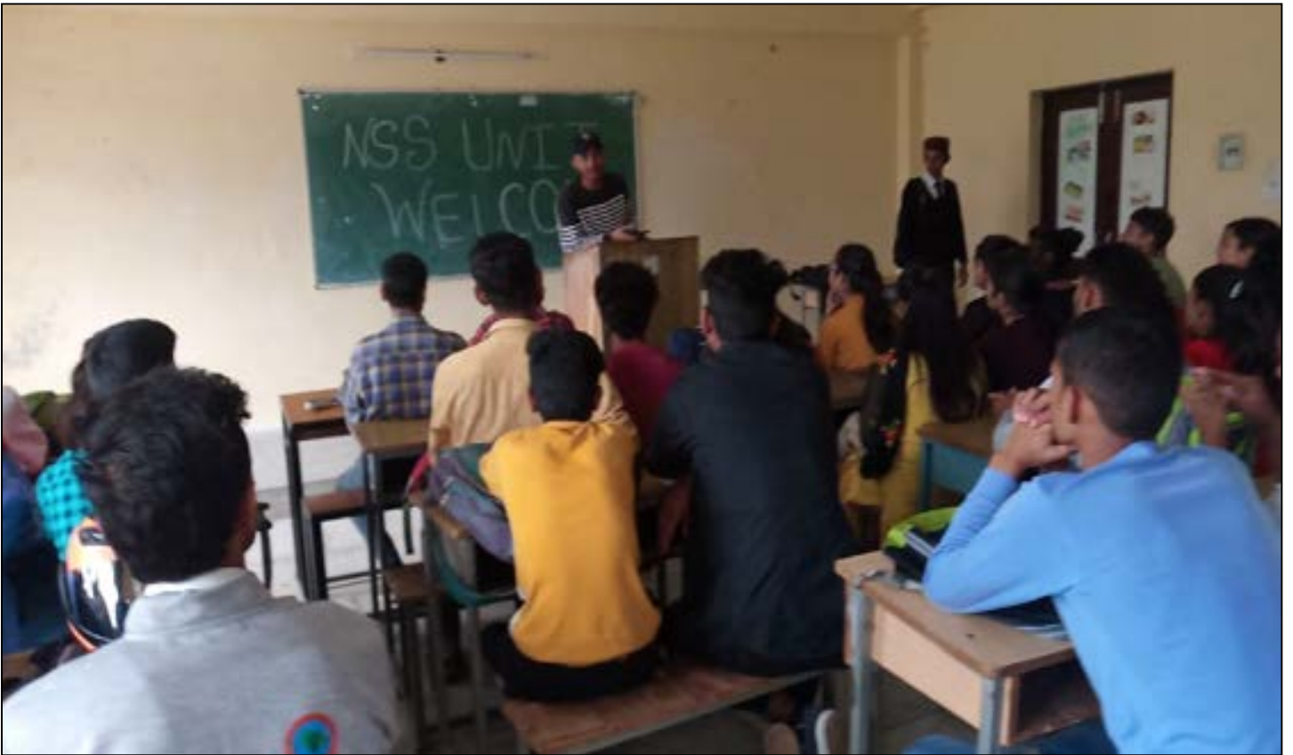
Conference on Drug Abuse and substance miss use