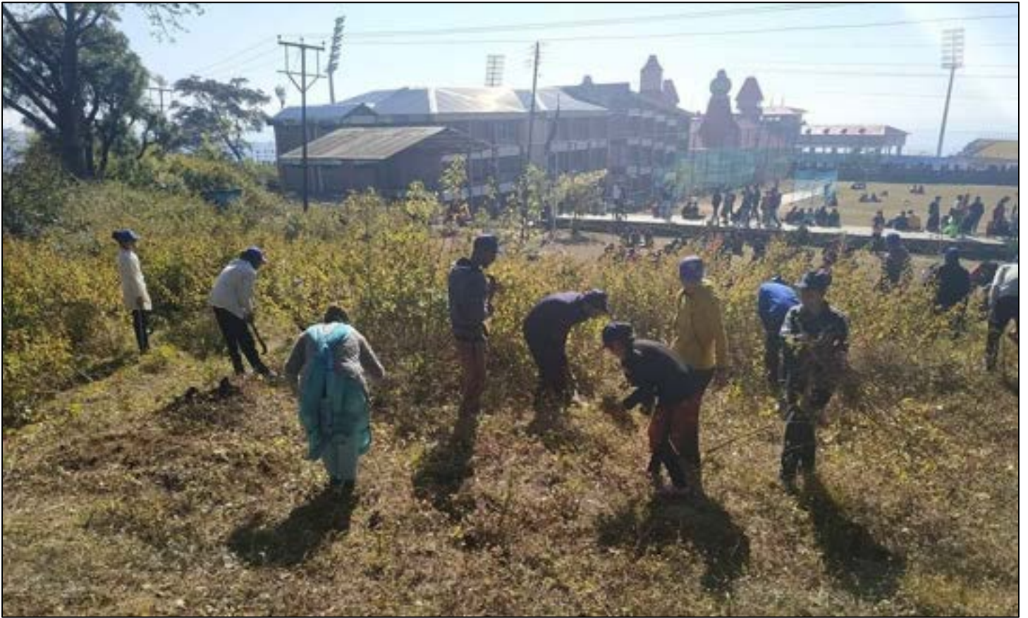
During Cleaning Drive at College Campus