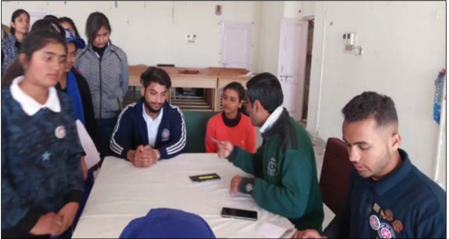
Interviewing volunteers for Seven days camp